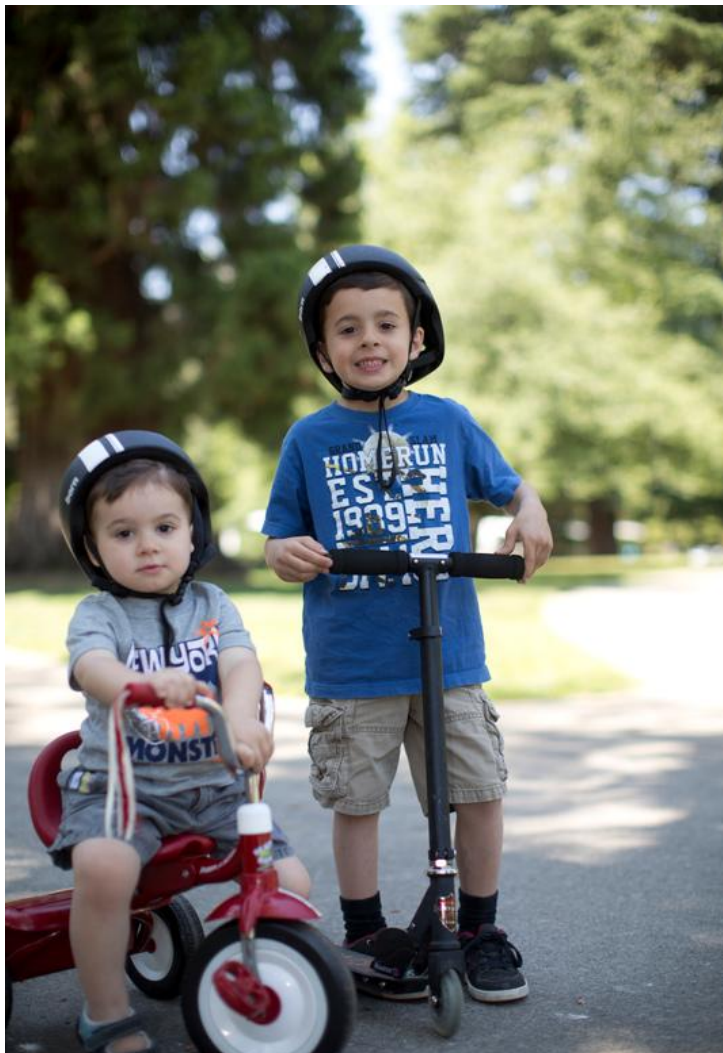
Two future bicyclists at the May is Bike Month Bikefest; held annually at the California State Capitol Building

This chapter highlights bicycle and pedestrian projects that were completed during FY 2013–14. It also details the positive impacts that these projects are having on the communities that built them. With the ATP, the positive benefits of such projects will accrue well into the future; providing more modal choices, a smaller “carbon footprint,” and increased safety and access for all California citizens.