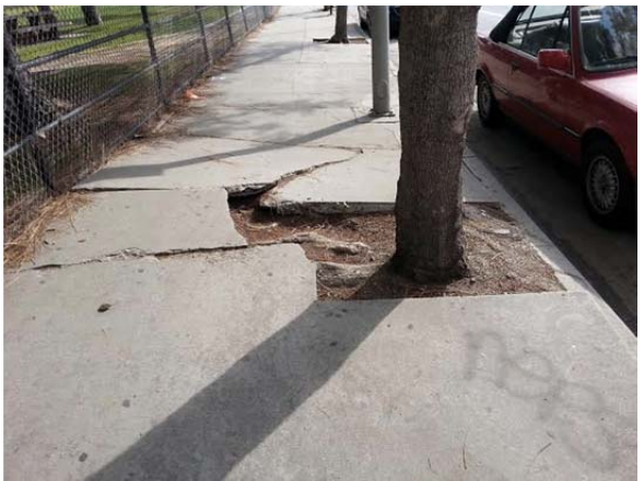
CD 1 – Hoover Recreation Center