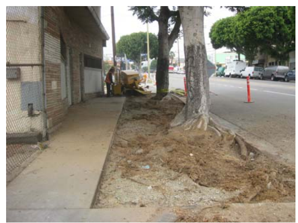
CD 14 - Boyle Heights Sports Center