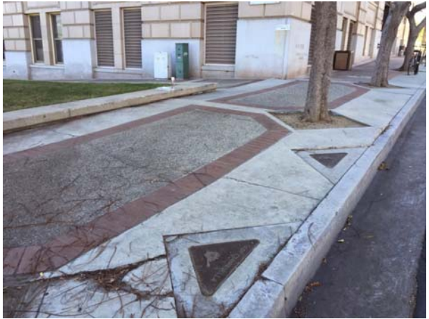
CD 15 - San Pedro Municipal Building

3. Decorative Paving – Some areas in the City have decorative paving, particularly in historical areas and business districts. Decorative paving makes replacement complicated, as the materials used at these locations are costly and may be difficult to procure.