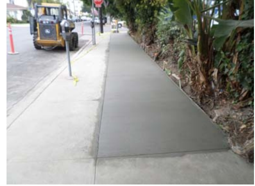
New Sidewalk CD 11 – West LA Municipal Building