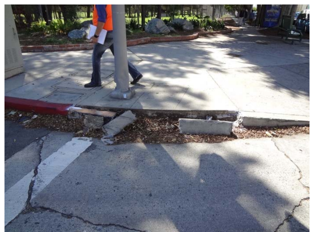
CD 5 - Cheviot Hills Park & Rec Center