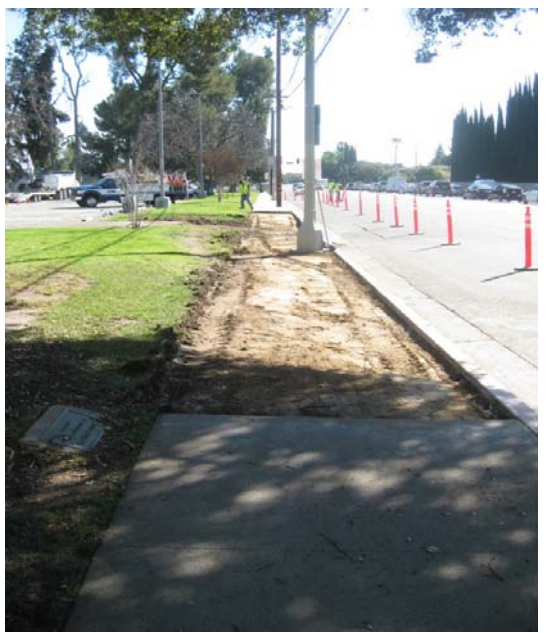
Demolished Sidewalk CD 3 – Reseda Park & Recreational Center