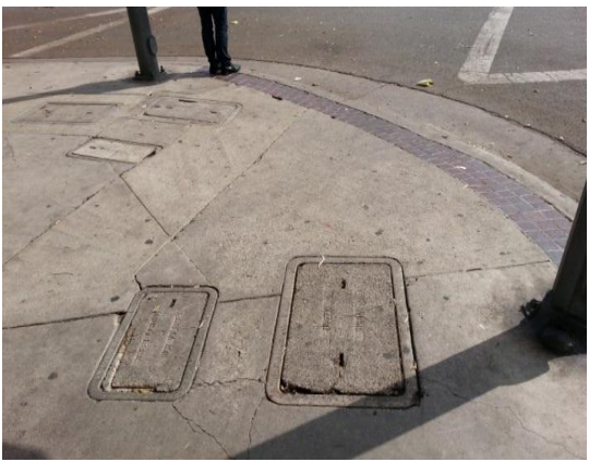
CD 14 - Central LAPD