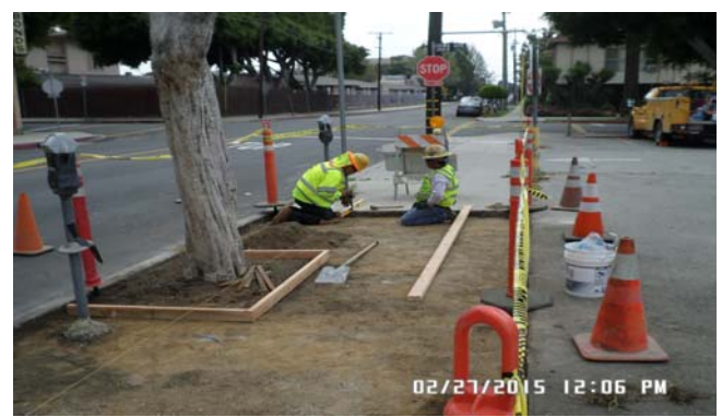
Forming for Concrete Placement CD 11 – West LA Municipal Building