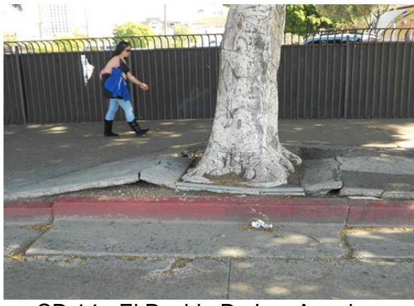
CD 14 - El Pueblo De Los Angeles

Tree Root Damage – Our field assessments indicate that the leading cause of damage in sidewalks is by root propagation from adjacent trees which uplift and crack the sidewalks. Tree roots can be pruned to accommodate new sidewalk construction; however future root regrowth may again damage the sidewalk. Tree replacement may be required if the root pruning compromises the tree's structural stability and its ability to thrive or if it is determined that root regrowth may cause repeated damage to the new sidewalk in a short period of time. Following are photos of tree root damage encountered.