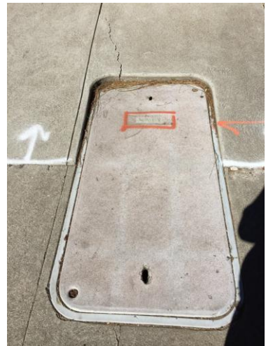
CD 12 - Porter Ranch Library