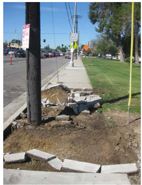
Demolished Sidewalk CD 3 – Reseda Park & Recreational Center