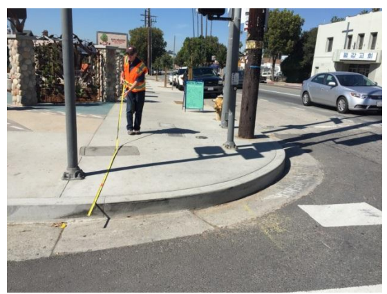
CD 14 - York Park (No Curb Ramp)

Another major challenge with curb ramp installation is the fact that there is often not enough space to install a standard plan curb ramp. Curb ramps often need to be custom designed to fit the available geometry of the intersection. The following photos exhibit the typical circumstances encountered during field assessments.