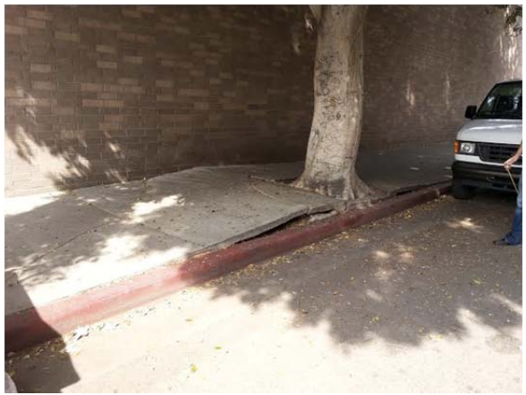
CD 14 – Central Police Station

The goal is to preserve trees wherever feasible. Each tree must be individually assessed and the team is working with the BSS and an independent arborist to determine when root pruning can be performed to allow the sidewalk repair work to proceed. Root pruning is likely to require commensurate crown pruning.