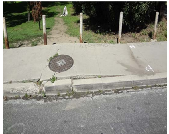
CD 14 - Hermon Park

4. Curb and Gutter – There are instances where the existing curb and gutter require repair. A contributing factor to the damage at these locations is often tree root propagation. Typically the adjacent sidewalk is damaged and requires repair in conjunction with the curb and gutter. It is necessary to replace the damaged sidewalk and the curb and gutter to allow proper alignment of the new construction. Curb and gutter repair requires street design work, which adds cost and time to the sidewalk repair.